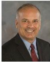
Mayor Richard Stewart City of Coquitlam