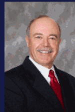
Mayor Ted Schaffer City of Langley