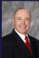
Mayor Ted Schaffer City of Langley