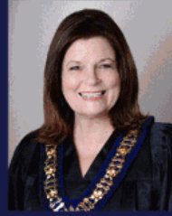
Mayor Sharon Gaetz City of Chilliwack