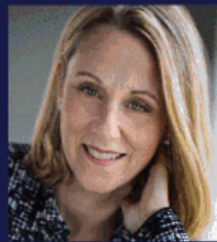
Mayor Nicole Read City of Maple Ridge